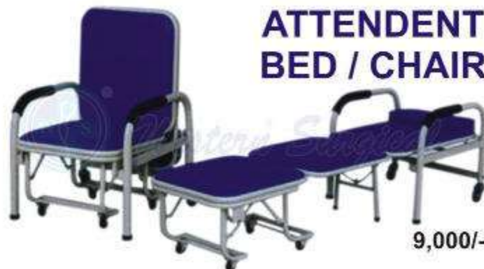
ATTENDANT BED / CHAIR

Finish: All components should be pretreated in separate eight tank process for better finish, good adhesion and corrosion protection. Process includes Hot Degreasing, Derusting, Activation, Phosphating & No's of Water rinses as per IS 3618 - 1966 class 'C' type and then pretreated materials is coated with epoxy powder with film thickness of 60 microns (approx.) and then oven baked at 180 degree centigrade.